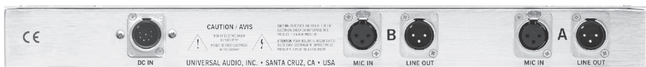
Figure 2: 2108 rear panel

The rear panel (Figure ) has two identical channels each with MIC INPUT and LINE OUTPUT XLR connectors. Also, the rear panel has a DC POWER INPUT receptacle. These connectors are discussed in the following sections.