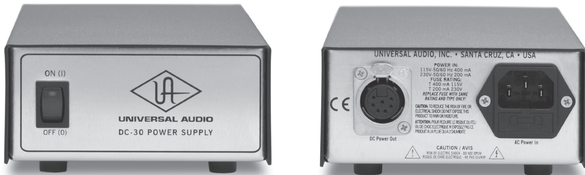
Figure 3: DC-30 front rear & panels

The 2108 ships with an external power supply which provides DC voltages to the 2108 via a supplied 7 pin XLR cable. Always use the supplied DC Power Cable. Using a similar looking cable may damage the 2108 and the DC-30 Power Supply. The DC-30 has an illuminated AC power switch. When this switch is on, the power supply will provide the 2108 with DC power. Both the 2108 power switch and the DC-30 power switch must be on for the 2108 to work.